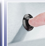
Deluxe Electronic Ignition System