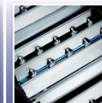
Stainless Steel Flav-R-Wave™ Cooking System