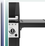
Stylish Steel Side Shelves